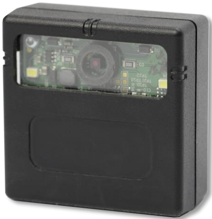
L: 45.1mm x 45.7mm x 20.1mm